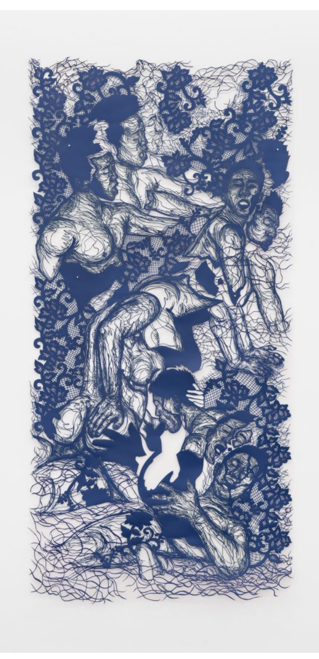
Image: Body called itself Master. Body named itself Free. Body bought its own freedom. Body sold itself to the top. Body broken glass all by itself. Body spills all the light. Body all the light. Body only dark when it wants to be., 2023.

From variegated lattice of finely cut and detailed paper emerges images of people in stages of sexual and physical intimacy. Antonius Tín-Bui's There are Many Ways to Hold Water Without Being Called a Vase was on exhibition at Monique Meloche Gallery from June 9th 2023 to August 25th, 2023.