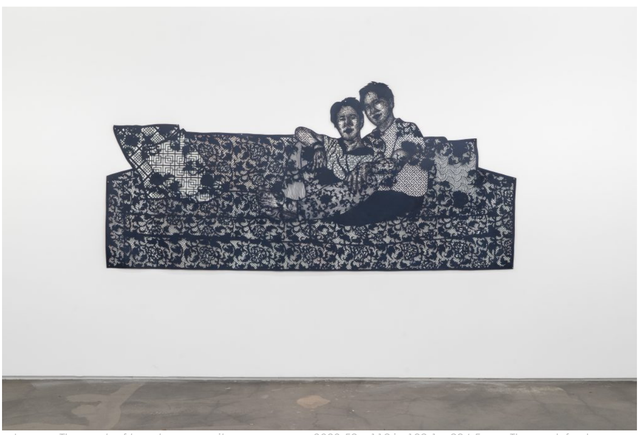
Image: The work of love becomes its own reasons, 2023 52 x 112 in 132.1 x 284.5 cm. The work features a detailed lattice of cut paper to illustrate two people holding each other on a floral-patterned couch.

In There are Many Ways to Hold Water Without Being Called a Vase I found a profound sense of serenity. It is only fitting that Bui's medium is a homage to Joss paper, a traditional Chinese incense paper burned for ancestral worship whose slow burn is a mirror to their meditative, devotional process. Each work is a weeks-long process and demands the constant repetition of Bui's hand, steadily removing paper like a prayer of peace for their subjects. For a community that has been fraught by overgeneralization and trapped beneath a "model minority" blanket, Bui's attention to the subjects in their art is more than an aesthetic triumph, it is a healing salve for queer, AAPI community chronic underrepresentation. By positioning breakage at the center of the practice, Bui takes an important step towards new visibility for Asian Americans—not as a singular front, but as a powerful, multitudinous community with light shining from between our lovely cracks.