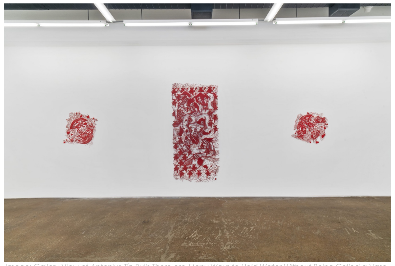
Image: Gallery View of Antonius-Tín Bui's There are Many Ways to Hold Water Without Being Called a Vase, 2023.

By Francine Almeda September 21, 2023 · Archives, Essays + Reviews, Exhibitions