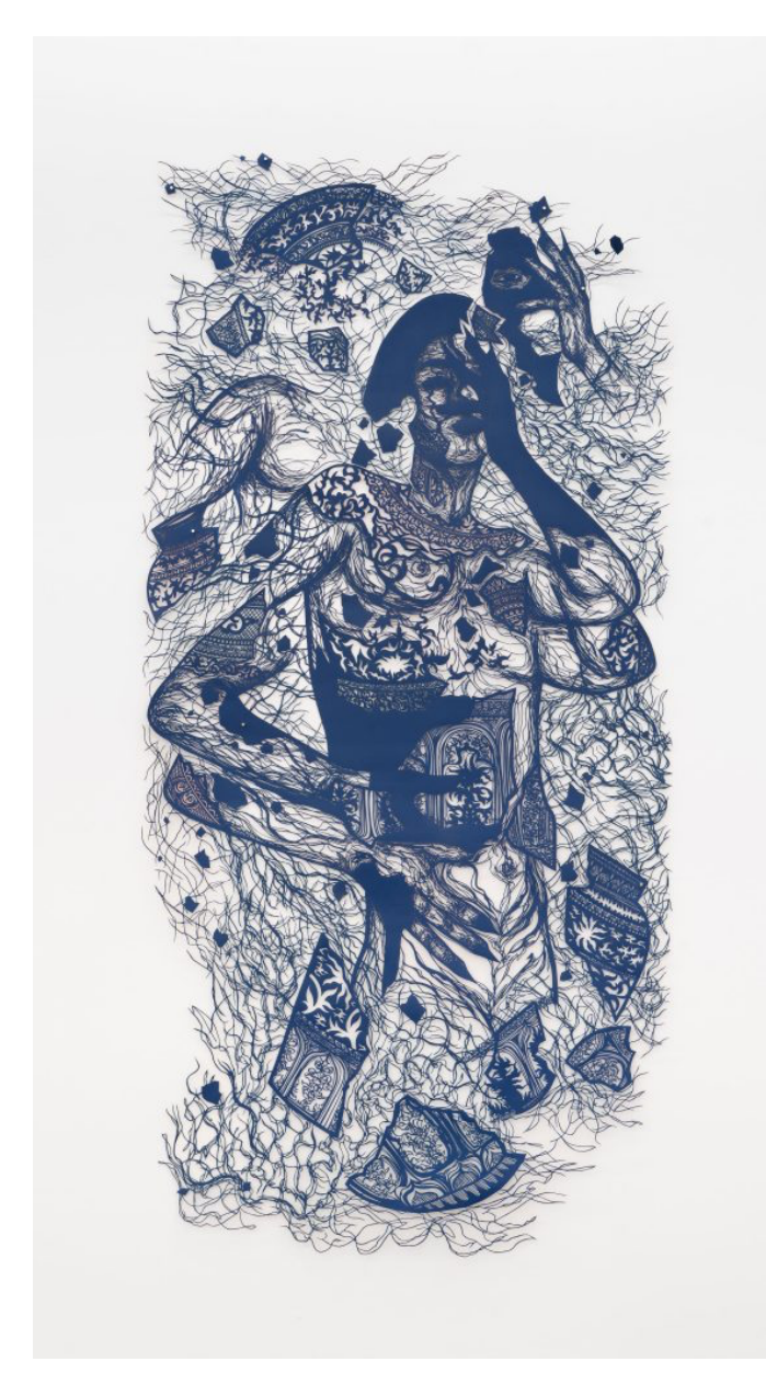
Image: There are many ways to hold water without being called a vase. To drink all the history until it is your only song., 2022. hand-cut paper, ink, and paint. 86 x 42 in 218.4 x 106.7 cm.

Reading the title again, I think of queerness as a vessel for water's fluidity and yet evades the limitations of a container; how being part of the Asian diaspora comes with an insatiable thirst to quench the feeling of otherness, pouring history down our throat until the interior of our being ruptures outward and bursts into unstoppable song.