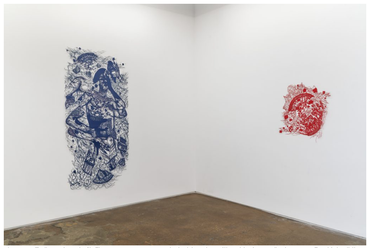
Image: Gallery view. Left: There are many ways to hold water without being called a vase. To drink all the history until it is your only song., 2022. Right: In Between Deaths, 2022. The left work is a lattice of cut paper in the shape of a person holding two hands on their hip and belly, and two other hands up above their face. The right artwork is red and circular.