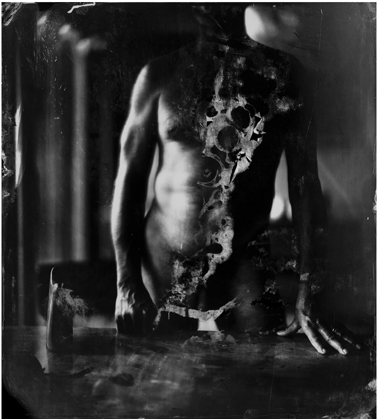
Sally Mann, Hephaestus, 2008.

however much this courage was enabled by their status as men in heterosexual marriages.