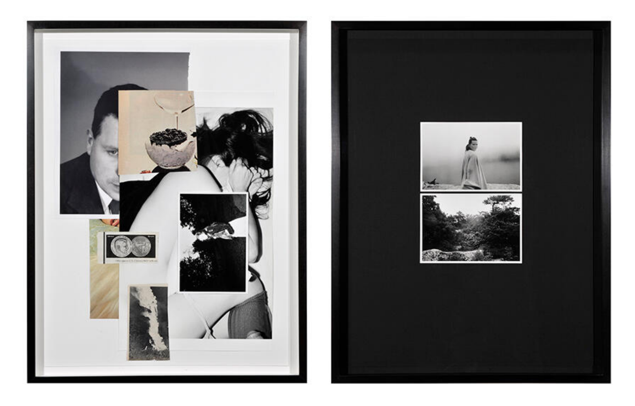
Leigh Ledare, diptych from the series 'Double Bind', 2010.

women subdued in Kinbaku-bi, or rope bondage, yet the curators chose work for this exhibition that examines vanilla, conjugal life, an apparent value judgment about what constitutes intimacy. Meanwhile, the art of queer people serves as a trickmirror alternative to crystal clear reflections of marriage and dating. Some might say this queer work is more avant-garde – but that's not exactly right. Nan Goldin's iconic slideshow 'The Ballad of Sexual Dependency' (1973–86) and Clifford Prince King's larger-sized tableaus and portraits made in 2018 and 2019 are no less figurative than the show's most conservative inclusions. The difference is that they depict found communities, and that they feel anonymous to a spectator, the subjects slinking away from the show's lazy contextualizing grasp. Writer, theorist and photographer Hervé Guibert's images of his partner, Thierry Jouno, are fabulously composed, but the curatorial framework makes them seem pat, like tokenized erect penises in a building full of semi-naked females rendered in a male gaze.