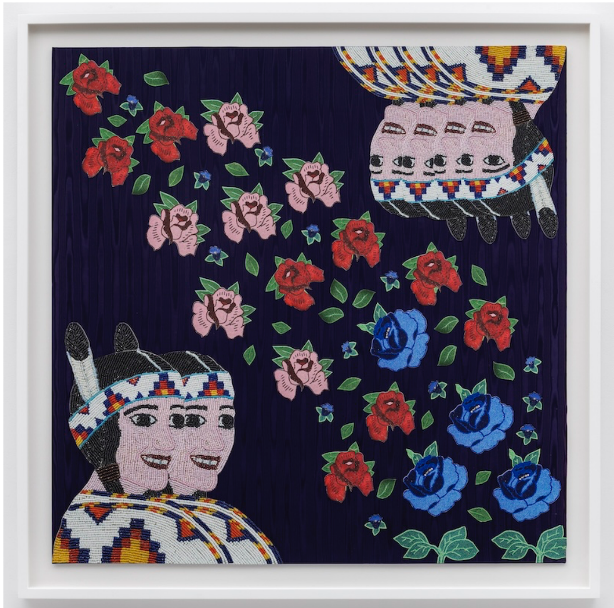
Wendy Red Star, "To Be Beautiful (bíaitche)," 2023, 44 x 44 in., Fabric and archival pigment prints mounted on gatorboard; Courtesy of the artist and Sargent's Daughters.

elusive paintings welcome a closer look into the decadence of mother nature's bounty.