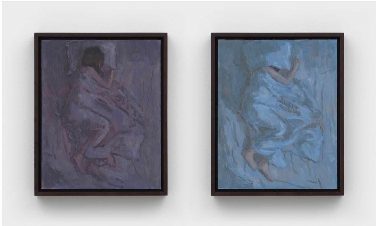
Silas Borsos, "The Blue Hour," 2024, Diptych, 10 x 8 inches each, Oil on panel; Photo by JSP Art Photography, Courtesy of the artist and Nicelle Beauchene Gallery, New York.

Gallery (Inglewood), Europa (New York), Monique Meloche Gallery (Chicago), Nina Johnson (Miami), Volume Gallery (Chicago), Luce Gallery (Turin), Ciaccia Levi (Paris), and Bradley Ertaskiran (Montreal). In addition, a spirited collaboration between Felix LA and premier international retailer Dover Street Market brings a site-specific store to the hotel's vast ballroom space.