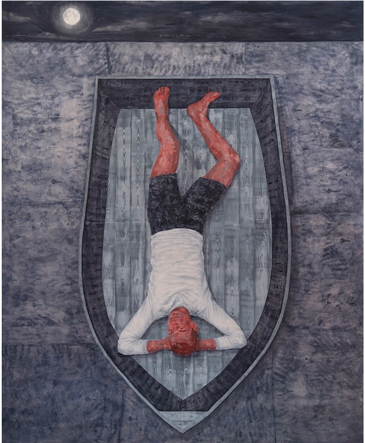
Adam Lupton, "Out on the Waves in the Night," 2023, 86.6 x 70.8 in., Oil and acrylic on canvas; Courtesy of the Artist and Storage Gallery.