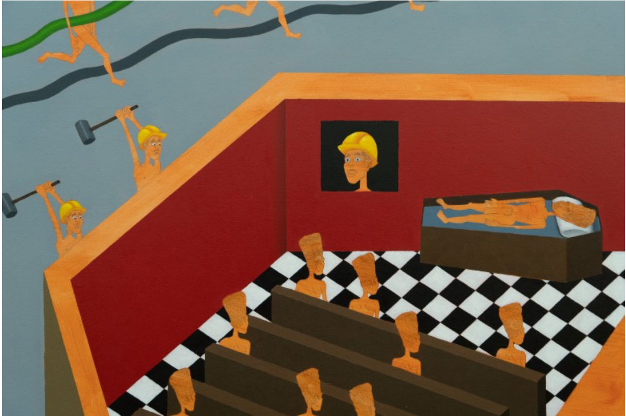
A detail from Don't Forget to Pack a Lunch!

451 N Paulina Street, Chicago 60622 312 243 2129 moniquemeloche.com