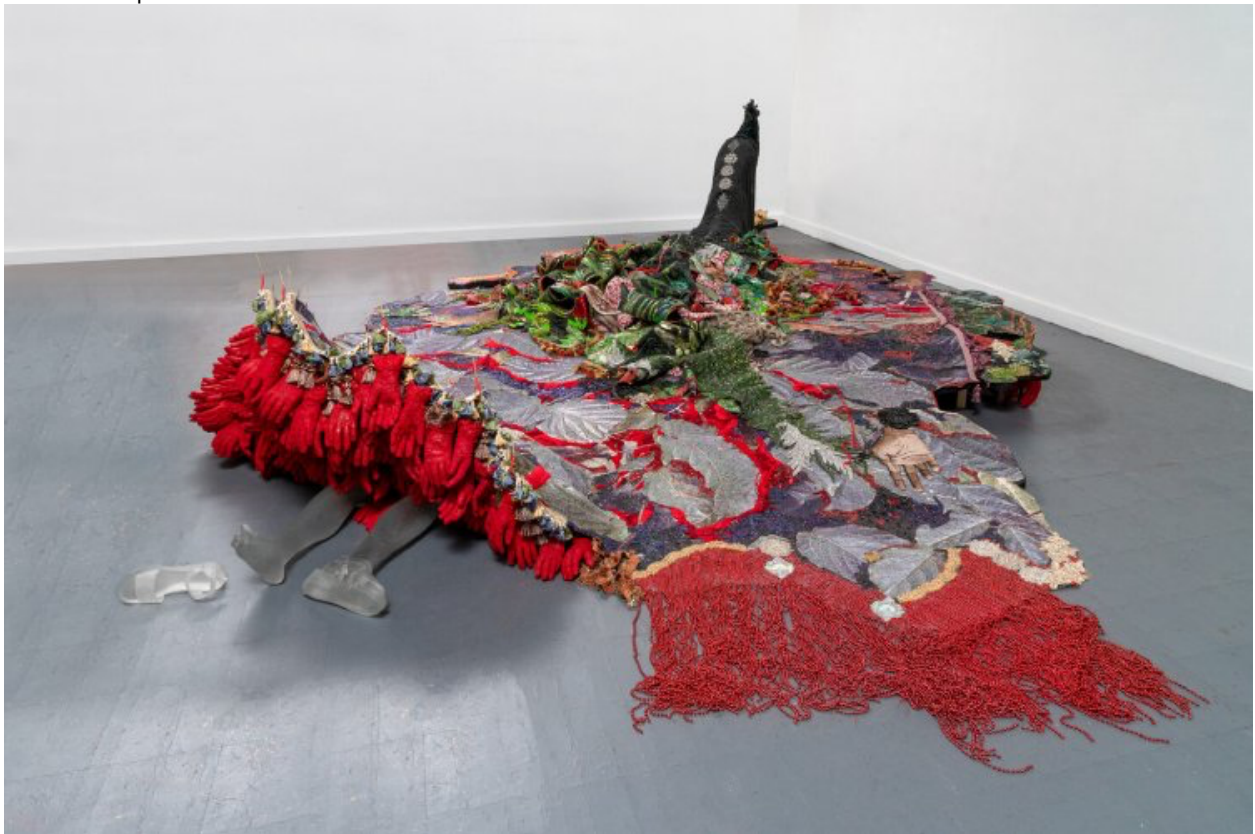
Ebony G. Patterson...when the cry takes root..., 2020, Mixed media, Courtesy of the artist and Monique Meloche Gallery, The Armory 2022

Ebony G. Patterson has used the metaphor of a peacock, its body transforming into a complex garden, manifesting as colonial Caribbean lands under British rule. The artist has touched upon the themes of diaspora, royalty, beauty, and the colonial past. The artist used conch shells to symbolize the burial rituals, where slaves placed the shells on the body of the dead during the memorial, emphasizing the materiality of objects and their cultural connotations. Meanwhile, Palileo's figurative paintings encompass the oral histories of migration and displacement.